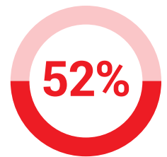
52% cost savings on project management