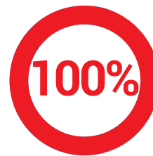
100% metrics-driven reporting and decision making